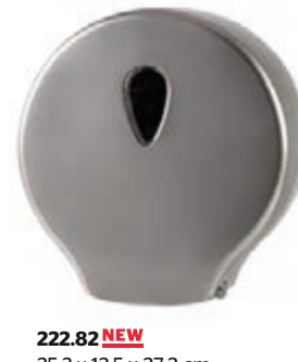
222.82 NEW 25,3 x 12,5 x 27,2 cm ABS - Plateado / Prateado / Silver 35,00€/U