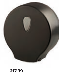
217.39 27,2 x 12,5 x 25,3 cm Int. Ø 4,5 cm ABS - Negro mate / Preto mate / Matt black CARTON: 1 U 34,00€/U