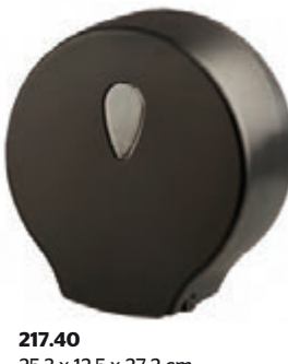
217.40 25,3 x 12,5 x 27,2 cm ABS - Negro mate / Preto mate / Matt black 35,00€/U