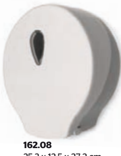
162.08 25,3 x 12,5 x 27,2 cm ABS - Blanco / Branco / White 16,00€/U