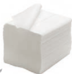
146.59 - 19 x 11 cm 2 capas / folhas / ply CARTON / MINIM: 36 PACK 1,20€/PACK