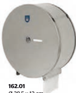
162.01 Ø 28,5 x 12 cm Inox / Stainless steel 39,00€/U