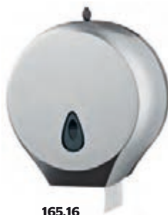
165.16 27,1 x 13 x 28,1 cm ABS - Metal CARTON: 16 U 23,00€/U