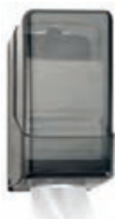
146.82 15,6 x 13,8 x 28,3 cm ABS - Fumé / Smoked CARTON: 12 U 15,00€/U