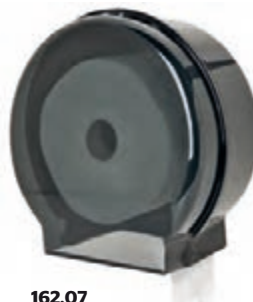
162.07 29 x 13,5 x 29 cm ABS - Fumé / Smoked CARTON: 6 U 19,70€/U