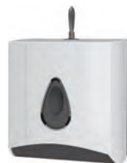
146.69 17 x 12,5 x 15 cm LDPE - Blanco / Branco / White CARTON: 36 U 13,00€/U