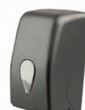
217.44 13,5 x 13,5 x 27,7 cm ABS - Negro mate / Preto mate / Matt black CARTON: 1 U 31,00€/U