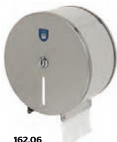
162.06 Ø 21,7 x 12 cm Inox / Stainless steel CARTON: 1 U 28,00€/U